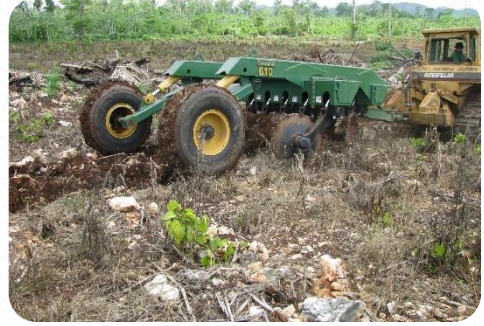
Maximize Marginal Soils With Rocks