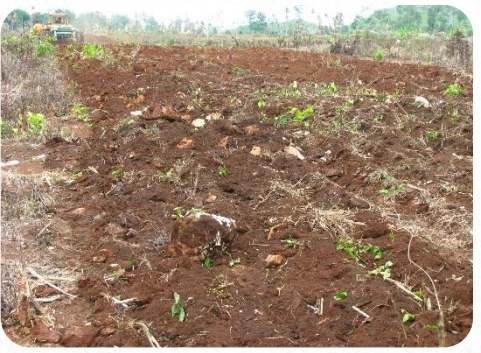
Results of Single Pass in Limestone