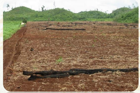
Blade w/ Dozer, then Plow and Bed