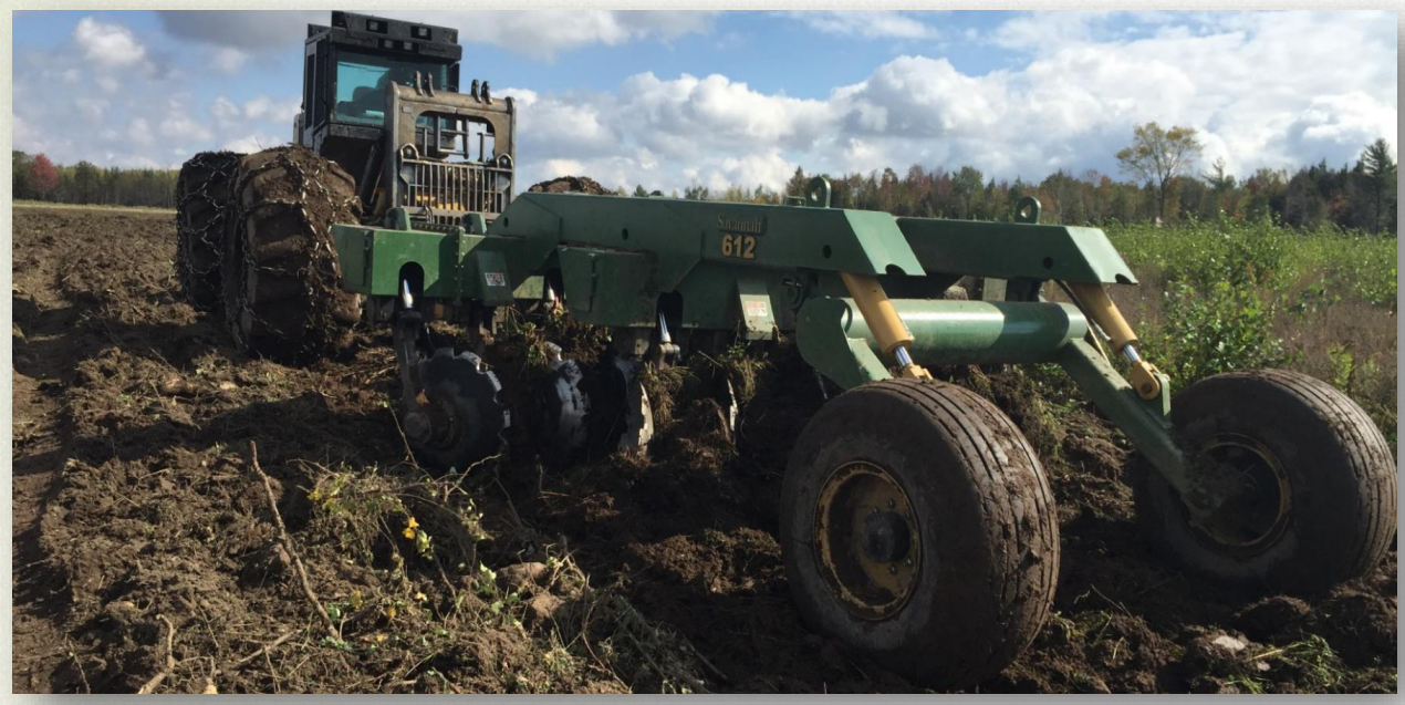
Savannah<sup>®</sup> Magnum 612 Offset Disc Harrow will work at speeds up to 5mph (8kph) through trash, rocky soil, and cutover stumps. A single pass with a Savannah<sup>®</sup> Offset Disc can replace two passes with a chopper and bedding plow, and provide superior grass control in Tropical Harwood Areas.