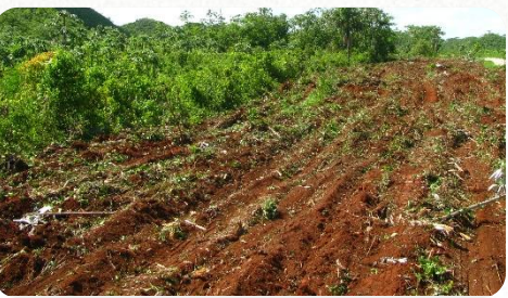
Eliminate 1-2m Tall Vegetation

Virtually Eliminates Grass Re-Growth in Tropical Species Establishments